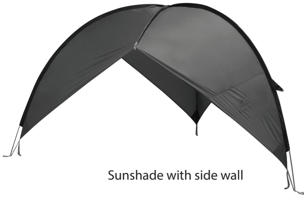
Sunshade with side wall

In order to familiarize yourself with your new shelter, we recommend you "test pitch" before your first camping trip. For additional information about Kelty products please visit Kelty.com .