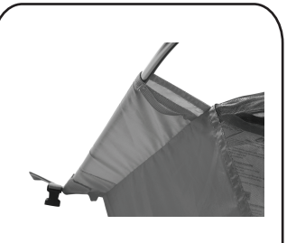
"Quick Corner" fabric sleeves

Tip: Please unsure each pole is fully seated within each Quick Corner sleeve.