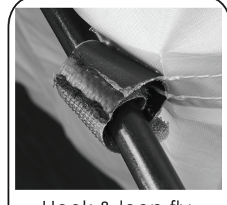
Hook & loop fly pole wrap