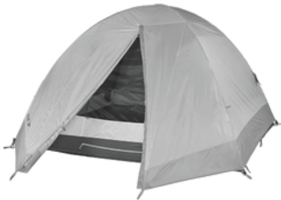
Outback 4 pictured