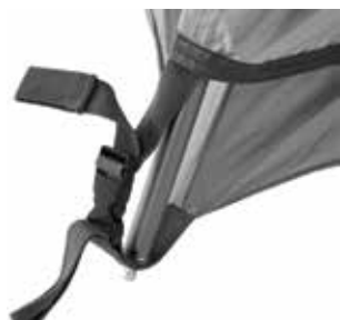
Tent fly attachment buckle