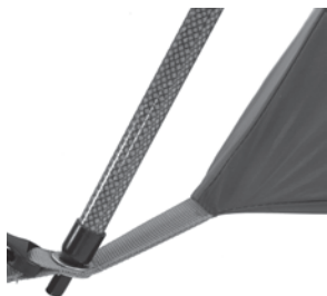
Grommet pole attachment

Insert pole tip into grommets at back stake loop corners, flex pole to stand up tent, insert pole tip into grommets on front stake loops. Be sure to lift tent body of 6 person as well as pole. 2 and 4 person, attach center clip at crossing point of poles.