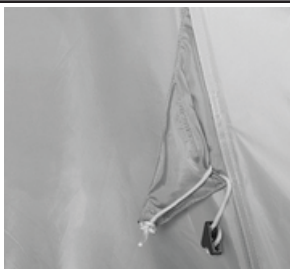
Guyline storage pocket