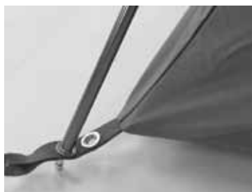
Grommet Pole Attachment

Step 2: Insert pole tip into grommet on stake loop at one end of each pole. From opposite corner, flex pole and insert tip into grommet.