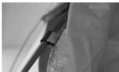
Guy out pole attachment hook & loop loop (underside of fly)

Step 3: Attach center clips over both poles at center "X". Work around the tent attaching all clips to the poles.