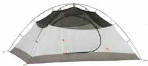
Outfitter Pro 2 pictured

In order to familiarize yourself with your new tent, we recommend you "test pitch" before your first camping trip. For additional information please visit http://www.kelty.com/c-tents-shelters.aspx .