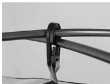
Center Double Clip