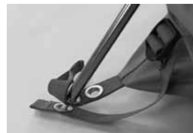
Rain Fly Grommet Attachment