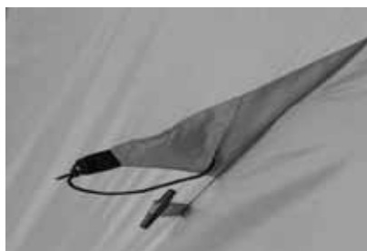
Guy Out with Storage Pocket