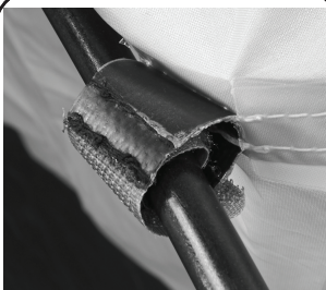
Hook & loop fly pole wrap