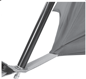
Grommet Pole Attachment

Insert pole tip into grommets at back stake loop corners, flex pole to stand up and insert pole tip into grommets on front stake loops. Attach center clip over pole near crossing point of poles.