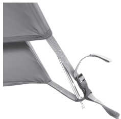
Grommet Pole Attachment & Fly attachment

Insert pole tips into the grommets at back corners, flex pole to stand up and insert pole tips into grommets at front corners. Be sure to lift tent body as well as pole.