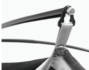
Kelty Connect ridge pole connector.