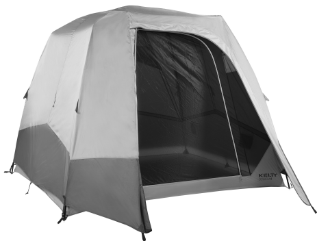
Sequoia 4 pictured

In order to familiarize yourself with your new tent, we recommend you “test pitch” before your first camping trip. For additional information please visit www.kelty.com .