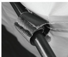
Hook & Loop pole connectors (located under guy out points)